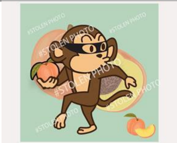
Most photos in the posts are captured from other online shops